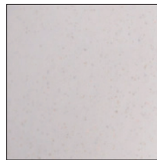
eco light brown